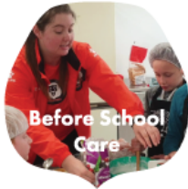
Before School Care