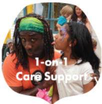
1-on-1 Care Support