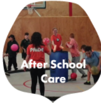
After School Care